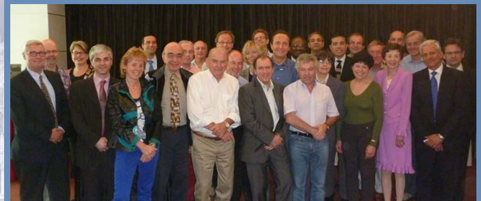
IAAS General Assembly, 2012